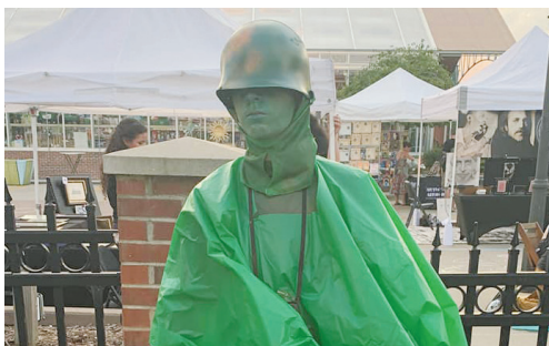
Life imitates art in downtown Owosso

"The Main Street organization has helped our DDA focus on the needs of our community. With this approach, we are able to move forward with advancing the vision for downtown Owosso."