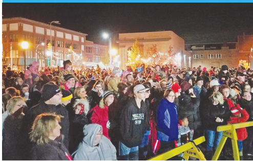
Owosso Glow brings our community together