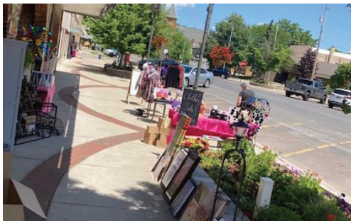
Sidewalk sales are both tradition and event