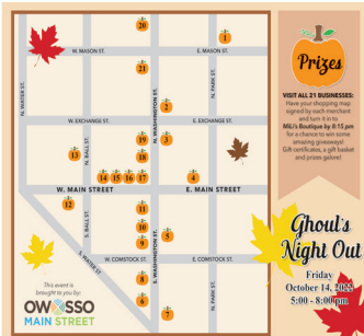
Creepin' it Real in downtown Owosso